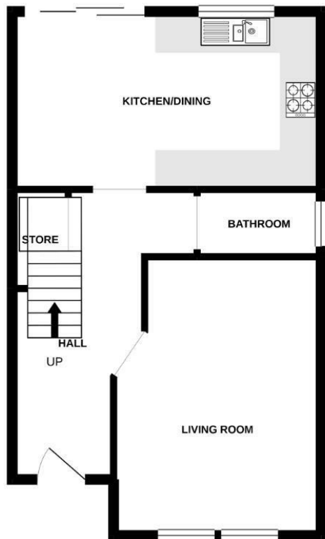
GROUND FLOOR 472 sq.ft. (43.9 sq.m.) approx.